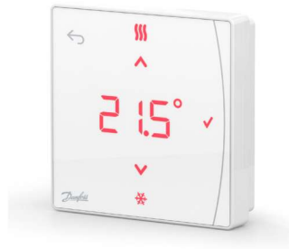
Danfoss Icon2™ RT 088U2121