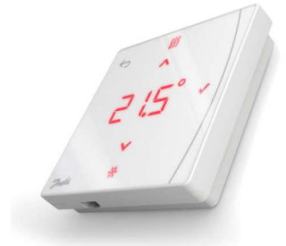
Danfoss Icon2™ Featured RT (IR sensor) 088U2122

Danfoss Icon2™ RT is a series of wireless thermostats that offers the freedom to place your thermostat without the constraints of wires in the wall. The fade away feature, together with the minimalistic design, only 16 mm deep, gives it elegance and makes it blend in with the surroundings.