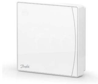
Danfoss Icon2™ Sensor 088U2120