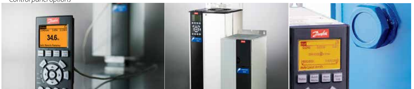
Control panel options

provided by the speed reduction at night and the limited number of starts and stops.