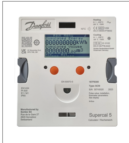
The Supercal 5 is Danfoss's next-generation calculator, succeeding the well-known Infocal series.

This new series is characterised by state-of-the-art multi-functional technologies, is based on a user-friendly modular concept and fully meets customer specific needs as simplified system integration, tariff and data logger functions, universal data transfer and connection to system processors.